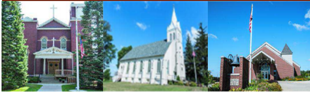
St. John, Coggon | St. Joseph, Prairieburg | St. Stephen, Central City