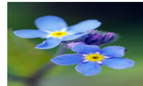
Forget-me-Not Grandparents Day