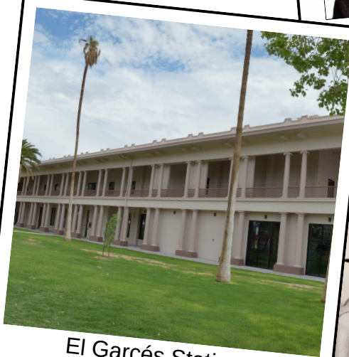
El Garcés Station Needles, CA