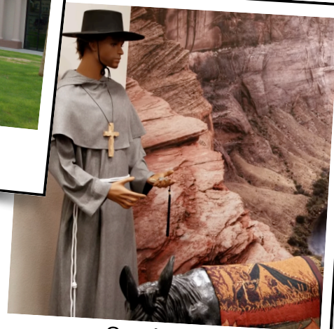
Garcés Center Laughlin, NV