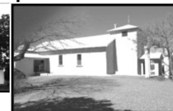
San Isidro Mission Gila, NM