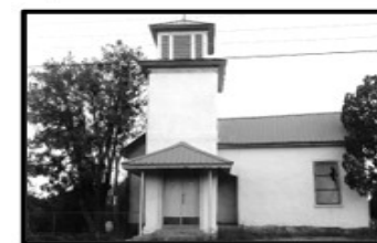
Holy Cross Mission Pinos Altos, NM

We honor the history and cultures of New Mexico.