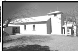
San Isidro Mission Gila, NM