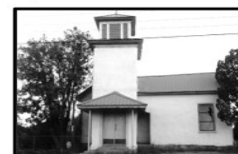
Holy Cross Mission Pinos Altos, NM

We honor the history and cultures of New Mexico.