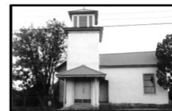
Holy Cross Mission Pinos Altos, NM