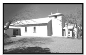
San Ysidro Mission Gila, NM