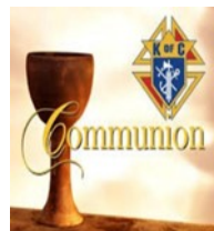
Knights of Columbus Corporate Communion Saturday, November 15, 2025 5:30 pm Mass

Society of Our Lady of Guadalupe by the Guadalupanas