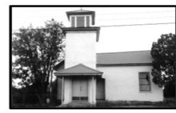
Holy Cross Mission Pinos Altos, NM