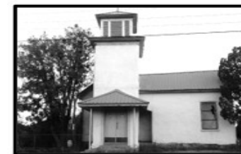
Holy Cross Mission Pinos Altos, NM