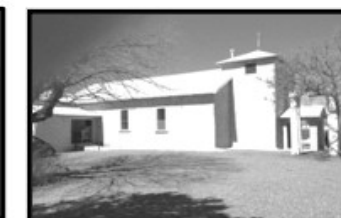
San Ysidro Mission Gila, NM