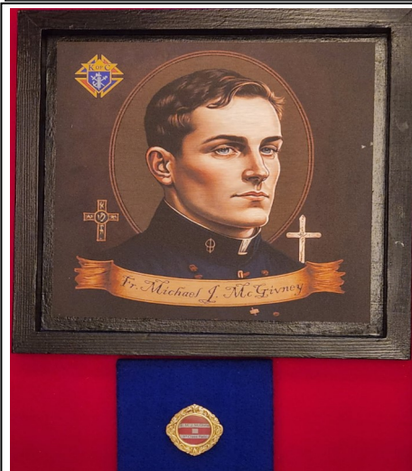
3rd Class Relic

Una Promesa de Proteger Si usted cree que ha sido abusado o victimizado por cualquiera que represente a la Iglesia Católica, llame al Defensor de la Víctima al 702-235-7723.