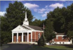
St Ann 370 South Fifth Street Williamsburg, Ohio 45176