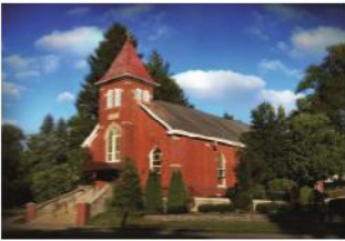
Holy Trinity 140 North Sixth Street Batavia, Ohio 45103

Monday: 9 am - 4pm Tuesday: 9 am - 4 pm Wednesday: Closed Thursday: 9 am - 4 pm Friday: 9 am - 12 pm