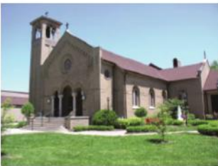
St Louis 210 N Broadway Owensville, Ohio 45160