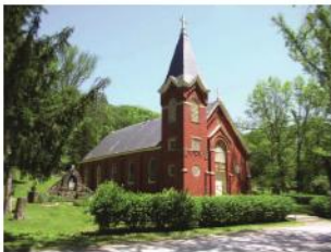
St Philomena 5236 Stonelick Williams Corner Rd Batavia, Ohio 45103