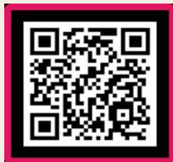
Parish Registration OLQOP

Go to the site anytime to watch live stream videos: 862 families subscribed—1.4K Videos