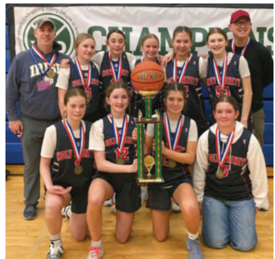
8th grade girls basketball team and coaches raise their CYO Championship trophy.

A big shoutout as well to our 7th grade girls' team, who finished as runners-up in their division! They played with determination and heart, and we know their future is bright.