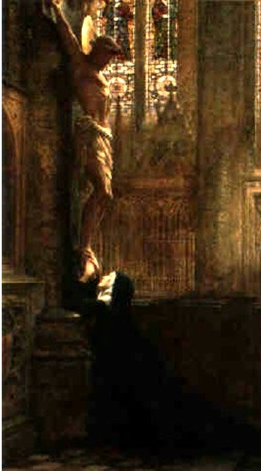
The Shadowed Face - Sir Frank Dicksee, 1909