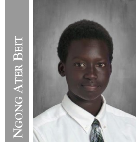
Peace of Christ