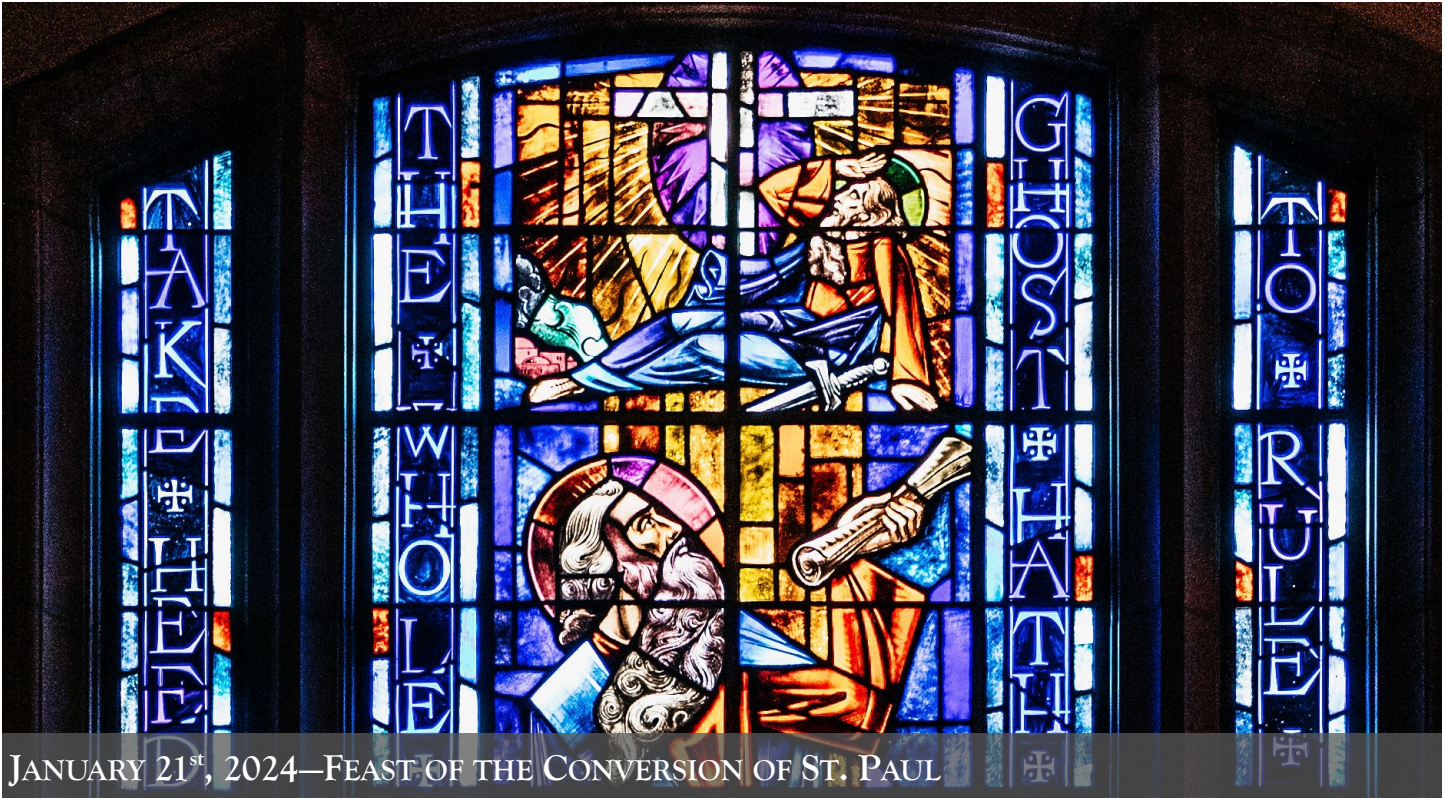
JANUARY 21 st , 2024—FEAST OF THE CONVERSION OF ST. PAUL

OUR MISSION: We are the temple of the living God, transformed by the Spirit into sacred vessels for the treasure of Christ. Like the monstrance, we present the love and light of Christ for all to see. Together, we become the dwelling place of God.