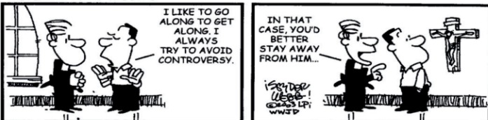
PRESENTATION OF THE LORD

In the modern lexicon, the quality of “kindness” is often equated with politeness — but real, virtuous kindness is so much more. Virtuous kindness is a way of seeing others through the eyes of God.