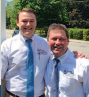
Father-Son Orthodontic Team