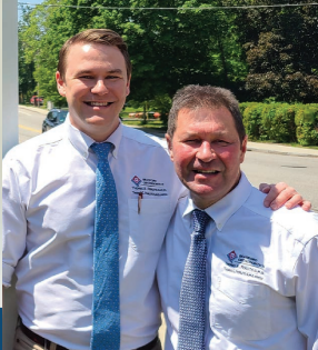
Father-Son Orthodontic Team