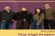
Music The Vigil Project