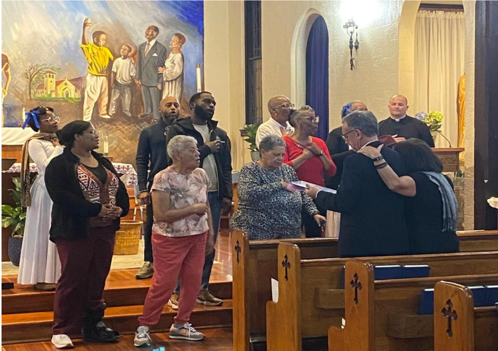
The Advent Revival and Mission of 2025.