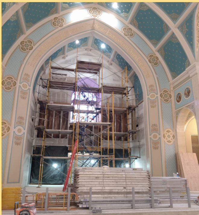
Above, scaffolding in the sanctuary awaits painters.

Below are updated photos of the progress of the interior of the Cathedral of St. Bernard of Clairvaux.