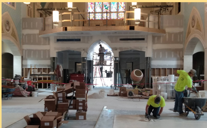
Work on the archway and the terrazzo floors continues.