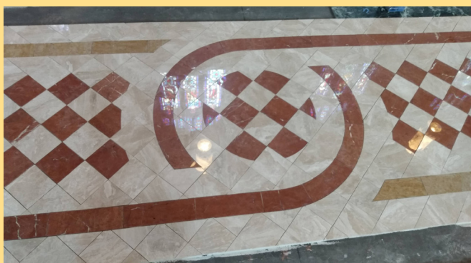
Pictured above is tile in the floor of the nave.