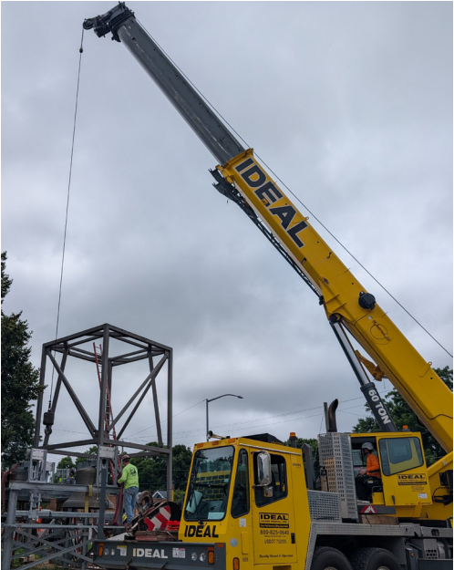
A crane lifted the steel superstructure and placed it next to the bells on July 17. The crane will return to lift the bells and the superstructure onto the tower in a few weeks.

Dear Friends, Another major milestone in the elevation project has come and gone with the arrival of the superstructure from our steel manufacturer in Sauk City. The weather cooperated so that we could offload the structure from the delivery truck and place it adjacent to the bell frame. Now that the superstructure is safely here on campus, our steel vendors will be working to attach needed items to the superstructure in preparation for its installation into the bell tower. The timeline for this work to be completed and for other logistical items to be addressed will add a timeframe of approximately three to four weeks. We'll be looking at mid-August as our target time for