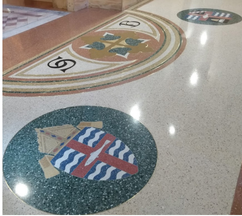
Shown here is the entryway to the cathedral.