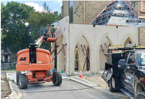
The front fascia of the covered parking lot entrance is welded in place.