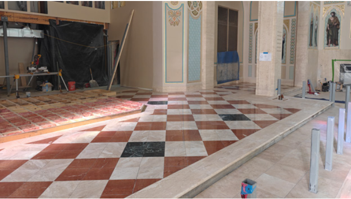
Shown above is progress on the sanctuary tiling.

Collected to date.....$ 42,056.06 Needed to date.....$ 68,464.00 Surplus / (Shortfall)..($ 25,807.94)