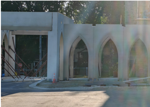
Erection of the covered parking entry is complete.

Envelopes.....$370,000.00 Loose (Cash).....$ 75,000.00 TOTAL.....$445,000.00