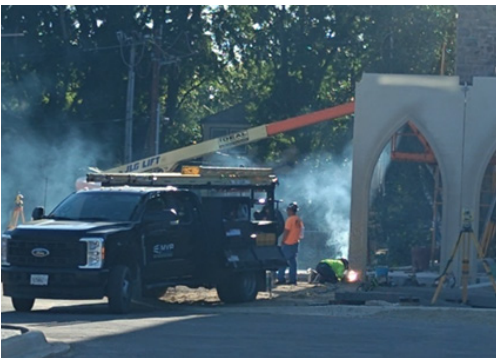
Smoke is generated as the first pieces of the covered parking entrance are welded in place.

While I know that some of you would like to be physically present to watch this great occasion, we will be very limited to the number of people we can have on campus due to the heavy equipment and potential risks involved. I will plan to live stream the lift on our parish Facebook page