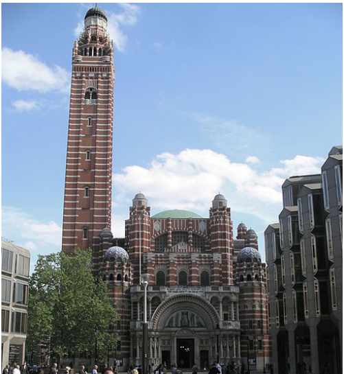
Westminster Cathedral in London

The Church of England was formed during the reign of King Henry VIII when he was denied an annulment after divorcing his wife, Catherine of Aragon. It led to a very sour relationship between the king and the pope, with an eventual secession from the Roman Catholic Church altogether and the formation of the Church of England. King Henry didn’t get what he wanted, so he went