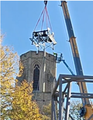
A photo from last week shows the cathedral bells being prepared to be lowered into the bell tower.

Thanks to everyone who toured the cathedral last weekend and offered a gift for the elevation campaign. I was very happy that you were able to see everything for your own eyes.