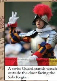
A Swiss Guard stands watch outside the door facing the Sala Regia.