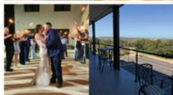
STOP BY TO VIEW OUR PICTURESQUE VENUE LOCATED ON 20 ACRES IN HELOTES