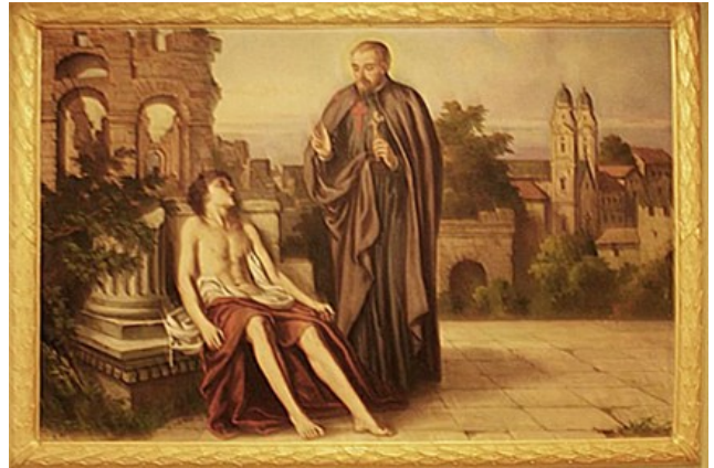
St. Camillus de Lellis, Mural at Marywood College, Scranton, PA. Patron saint of hospitals, nurses, healthcare workers, sick..

The living can always donate non-vital organs such as a kidney or liver. This type of donation is to be honored as a true gift of love for another. For a patient who has died, the ethics of organ donation depends on two criteria: informed consent from the patient or family and the patient's confirmed death before vital organ removal.