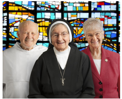
Used by permission. Photo by Jim Juddis. © 2025 United States Conference of Catholic Bishops.