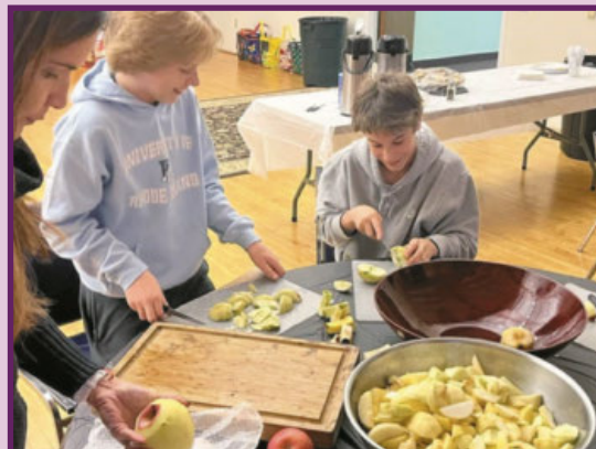
Our beautiful 8th graders preparing apple pies for Thanksgiving Baskets!