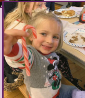
A visit from St. Nick December 3rd