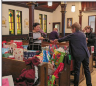
Our wonderful Giving Tree Volunteers sorting the gifts! Thank you to ALL who donated! December 10th