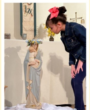
Our beautiful St. Mary's children crowning Mary and leaving flowers at her feet on Mother's Day! Sunday, May 12th