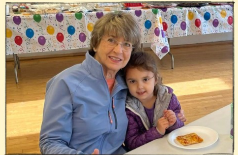
Our wonderful St. Mary's Parishioners enjoying a night of Fun and Games! Friday, May 3rd