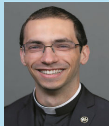
Theology III St. Kiernan Shelby Township