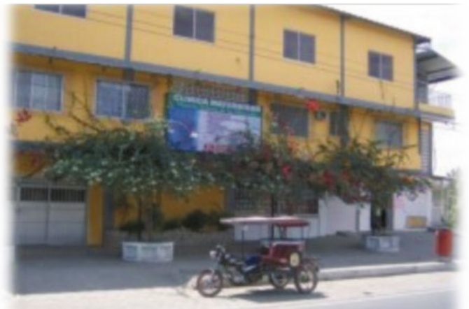
Clinic in Pedro Carbo