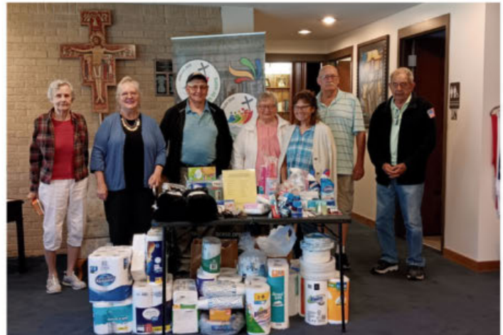
Picture of donations to Stateline Works of Mercy, a summer project of St. Stephen Church, Clinton.

If you need to change the location, day, or time of a meeting at ANY of our four Queen of Martyrs churches, you need to check with the Parish Offices to avoid a conflict with something else which may be scheduled.