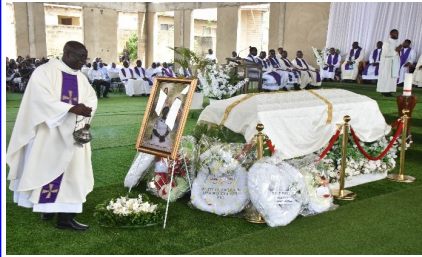
At the funeral Mass

This weekend, I wish to bring you some glimpses of what the funeral celebration was with a few pictures so you have an idea of how funerals are celebrated in Ghana, and that you can continue to offer prayers for my family and the repose of my mother's soul.