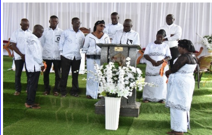
Tribute to mom by siblings