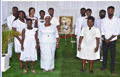
Nephews and Nieces