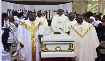
My priest classmates carrying the casket out