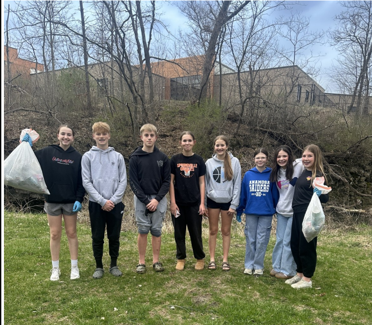
Thank you to the 7-8th Grade RE Students for cleaning up Butler Park April 9th!

Additional information is available on the Archdiocesan website: https://www.dbjournneyinfaith.org/final-pastorate-plan