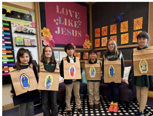
IHM School students celebrating Our Lady of Guadalupe