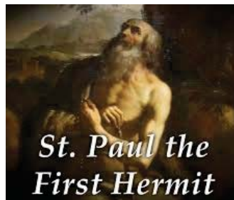
St. Paul the First Hermit

Bulletin requests are due 10 days in advance. Please email them to bulletineastbuffalo@gmail.com