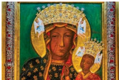
St. John Gualbert Our Lady of Czestochowa Chapel