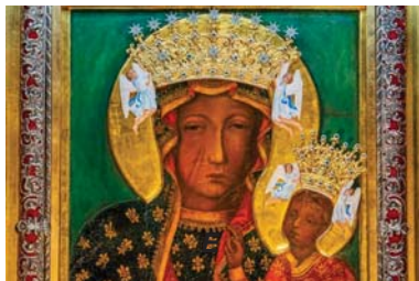
St. John Gualbert Our Lady of Czestochowa Chapel