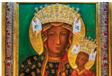
St. John Gualbert Our Lady of Czestochowa Chapel CHAPEL PLAQUES