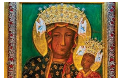
St. John Gualbert Our Lady of Czestochowa Chapel CHAPEL PLAQUES