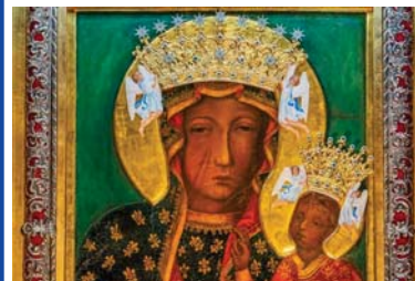
St. John Gualbert Our Lady of Czestochowa Chapel CHAPEL PLAQUES