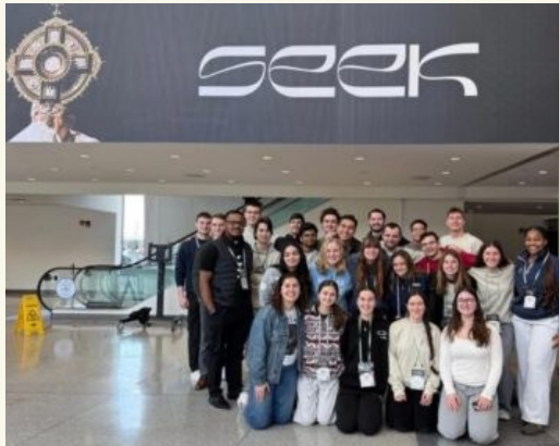
Students from the Newman Catholic Center at UMass in Amherst attended SEEK 2026 in Columbus, Ohio.

music, SEEK held social events, such as speed dating. But Mass and Eucharistic Adoration were the highlight for many.