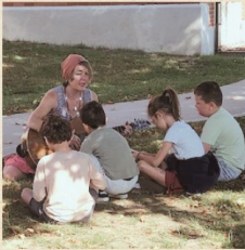
Music at CCD

Do you have young children and need support as they grow in the Catholic faith?