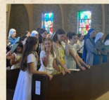
Maidens of the Eucharist & Lectors

Do you want to see your boys & girls serving in some capacity at Mass?