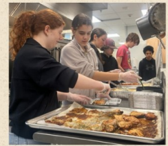
Bread of Life

Do you have teens who would want to connect with others their age who share our Catholic faith?