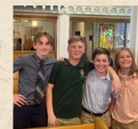
Younger Siblings at Confirmation Mass

Do you want your children to get to know the kids of our parish?