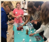
Deanery Youth Faith Formation Group

Are you passionate about supporting and engaging with our parish youth?