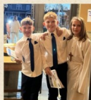
Altar Servers & Ushers