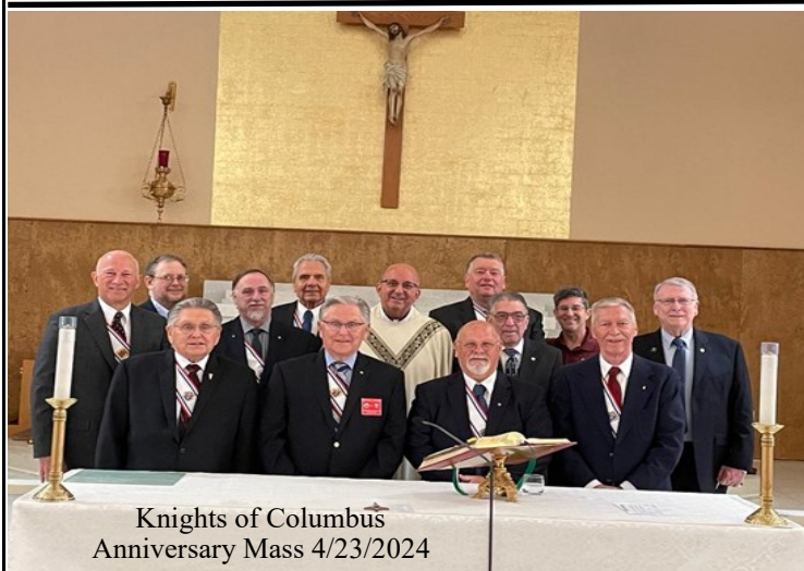
Knights of Columbus Anniversary Mass 4/23/2024

This annual flower sale is conducted on behalf of Pennsylvanians for Human Life (PHL), a local non-profit pro-life organization whose mission is to promote the Church's teaching about the sanctity of human life, from conception to natural death. In this annual flower sale, we ask for volunteers from Bethlehem area parishes to participate in selling flowers to benefit PHL. The proceeds go toward billboards around Lehigh Valley, strongly promoting the beauty of the Church's teaching about human life. The organization also sends newsletters with content that includes tips on how to live the Gospel of Life, how to promote the right to life of the unborn, as well as awareness of issues plaguing our society such as euthanasia and IVF.