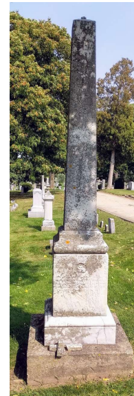
Parish Cemetery Seminar 2021